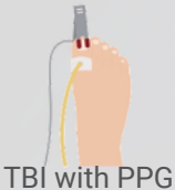
TBI with PPG