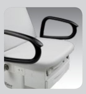
Assist Arms Designed to offer patients a stable gripping surface for accessing the chair and a sense of security during