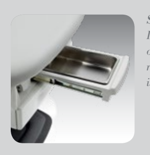
Stainless Steel Treatment Pan Ideal for lower-body procedures or other situations in which removal of fluid and debris is necessary.