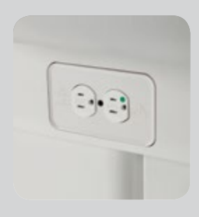
Tamper-Resistant Receptacles* Fassy-access recentacles

Easy-access receptacles on both sides of the chair provide a power connection for ancillary devices. And they are tamper resistant to help prevent injury.