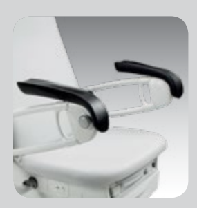
Patient Support Rails Plus™ Help achieve proper positioning of the patient's arm for blood pressure capture.