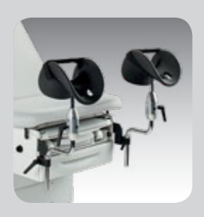
Articulating Knee Crutches The unique ball-socket design allows for a maximum range of adjustment, designed to ensure optimum knee and leg support. Available in non-articulating option.