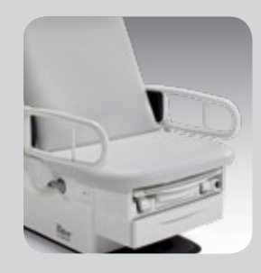
Patient Support Rails™ Provide patients with a 1½ inch diameter continuous gripping surface for entering, exiting or repositioning on the exam chair.