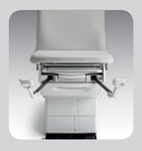
Stirrups and Pelvic Tilt* Help position patients properly and comfortably for lower-body examinations.