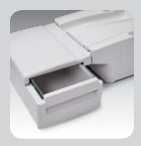
Supply Assistant Provides extra storage for bulky exam supplies. Keeps drapes, gowns and similar items within easy reach.