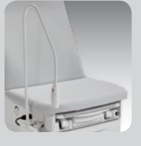
Ritter 253 LED Light Designed with easy access controls, high intensity light and an adjustable focal spot. Available in table mount and mobile options.