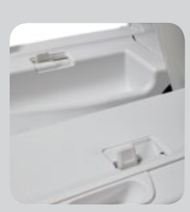
Clean Assist™ Roller System The retractable roller base allows you to easily and safely move the chair for cleaning.