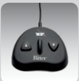
Foot Control Standard foot control designed to make patient positioning quick, effective and always within reach