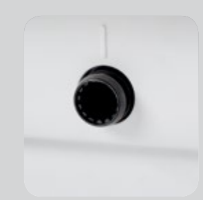
Accessory Receivers Standard receivers are designed to make the integration of accessories easy and efficient—no tools required.

Easy-access receptacles on both sides of the chair provide a power connection for ancillary devices. And they are tamper resistant to help prevent injury.