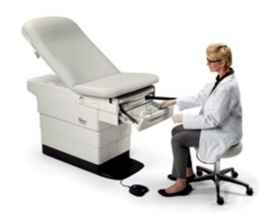
Ritter 224 Barrier-Free® Power Examination Chair

Ritter 224 and 225 Barrier-Free exam chairs are designed for properly positioning patients when necessary for lower-body examinations.