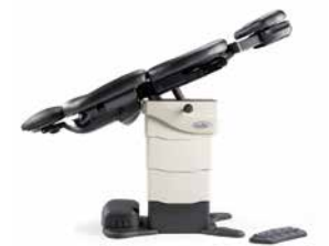
TRENDELENBURG Widely used as a first-line treatment of acute hypotension and/or shock