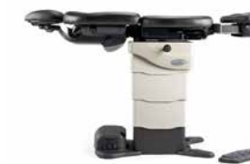
ELEVATED FLAT Can improve access and visibility to the patient's head, neck and torso