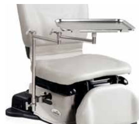
DOUBLE ARM INSTRUMENT TRAY