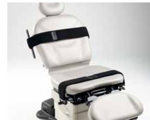
Adjustable width and location