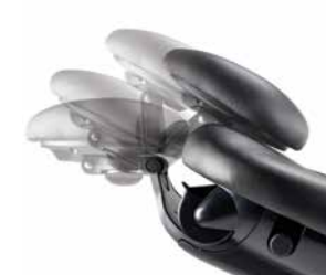
Articulating Headrest Tilt the patient's head or adjust for different procedures, improving access and patient comfort.