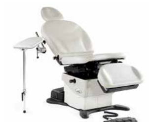
8.5" W x 26" L