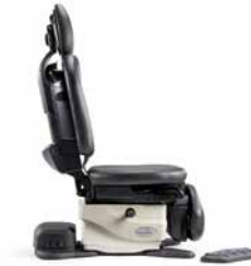
BARRIER-FREE ENTRY Low height of 19" allows for better patient access