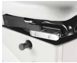
Procedure size 1 1/8"