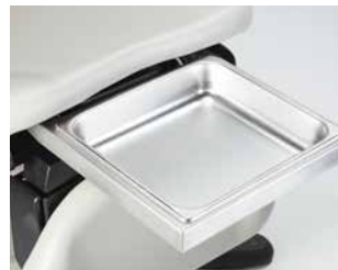
Larger option debris tray 13" W x 12" L x 1/2" D