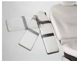
7" W x 24" L