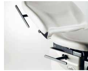
Procedure size 1 1/8" and standard size 1"