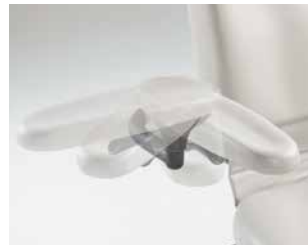
Fits 28" and 32" upholstery widths