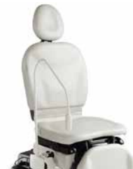
RITTER® 253 LED EXAM LIGHT

Available in chair mount (spline or rail), wall mount and mobile options