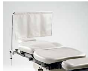
Blocks patient's line of sight