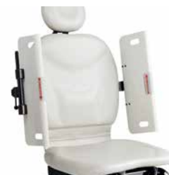
SECURITY SIDE PANELS