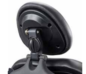
Tool-Free Adjustment Simply loosen the knob, rotate the headrest up or down and retighten.