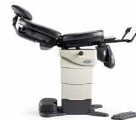
LITHOTOMY Position patients for lower-body procedures