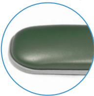
SOFT, WIDE ARMREST