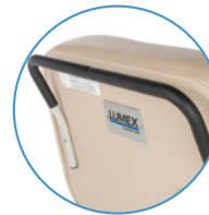
REAR PUSH HANDLE