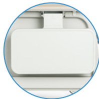
FOLD DOWN, FLUSH-MOUNT SIDE TABLES