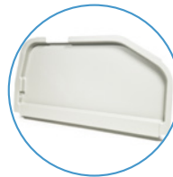
REMOVABLE SIDE PANELS