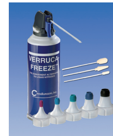
65 Freeze Kit (Order # VFK65)