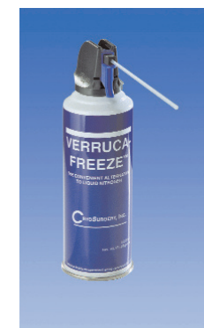
65 Freeze Canister (Order # VFC65)

5829 Old Harding Road Nashville, TN 37205 (615)354-0414 (800)729-1624 Fax (615)354-0466