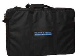
Carrying Case for 553KL Item # 553CASE